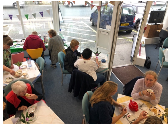
A successful pop-up café in aid of MacMillan

Clay monsters have been made, Christmas cards, Stained Glass workshops, several fundraising mornings have been held for breast cancer and Macmillan hospice. This is something we would like to develop more once we have a workable kitchen.