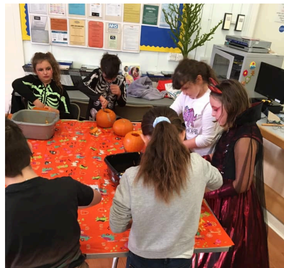
Pumpkins pumpkins everywhere

The project is in the developing stages and would benefit greatly from any donations such as dry goods, fruit and vegetables as well as any other food and we are looking to develop a drop off system at the centre. We also need and baking trays or cooking pots and pans as ours are a little worse for wear.