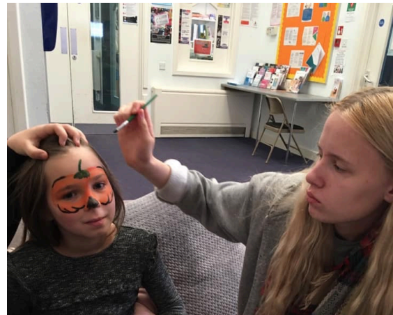
Preparing for the spooky event

there was music, games, arts and crafts as well as pumpkin carving and face painting. The young people all enjoyed food prepared by our Young Advisors as well as a member of the church.