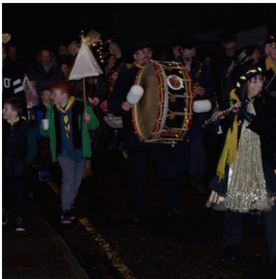
Street band and cubs

A lantern parade with approx. 200 people took place in February. Due to last minute problems, the image projection was not able to go ahead.