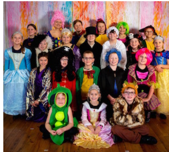
Par Bay Panto

Two sell out performances involving 20 children took place in December 2020, after just 8 weeks of rehearsal. Despite this success and the demand from the community for a similar event in 2020, the impact of the pandemic has meant that this will not go ahead.