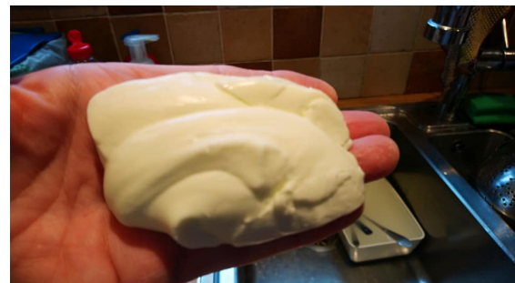
Playdough soap, salt dough

Re:Create Online fun and creative workshops re-purposing household items, aimed at families and young people.