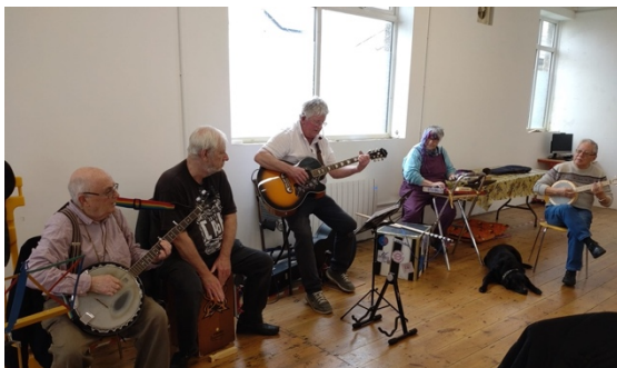
The Hub Skiffers

We provide an affordable, freshly cooked hot meal, companionship, activities and support. All are welcome to drop in for a cuppa or lunch. A recent visitor treated us to an Indonesian meal of vegetarian frittatas, with a delicious curry and rice. Some bring along their knitting or crochet. Some pick up a book from our mini library, or catch up with emails. We do crosswords, word searches, crafts-anything enjoyable. Wednesdays are Quiz days, very entertaining.