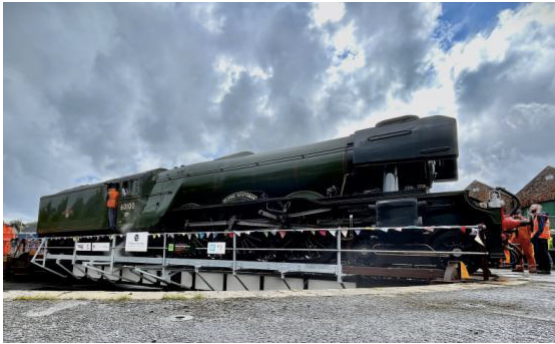
World Famous Visitor: On 30 th April, the Flying Scotsman was the first locomotive to visit Cornwall and use the St Blazey turntable after its return to operation

Engineering and Construction Skills - Lessons that Last a Lifetime