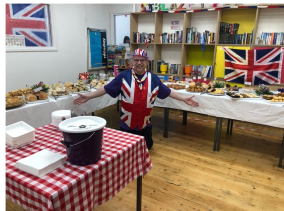
The Big Lunch

The whole group have recently joined together to prepare for our Big Coronation Lunch which was a great success with a wonderful array of delicious food and exquisite table centrepieces. Thank you all for your donations. We were entertained by activity groups from the Hub, Losty Ukes and the Hub Skiffers.