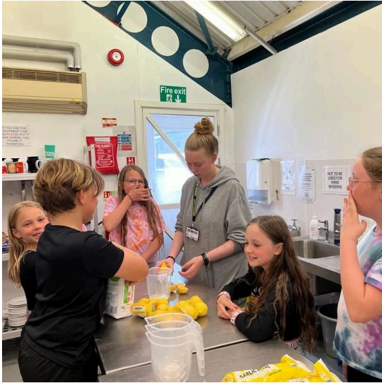
The PL24 Youth Group

Mental Health awareness week PL24 youth group made lemonade, played prize bingo and were finding ways to relax with playdough and games in the sports hall.